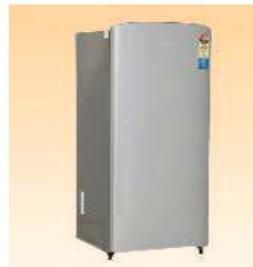
Fridge - Rs.3750