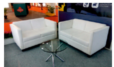
Double Seater Sofa - Rs.3000 ( Each )

Redefining Water Exhibitions in South Asia