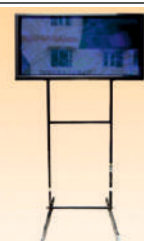
LED TV 40" - Rs.5000 ( 3 Days )