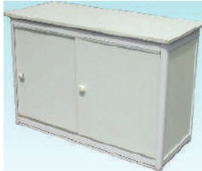
Lockable Table - Rs.2000