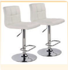
Hydraulic Bar Stool -Rs.1000 Each