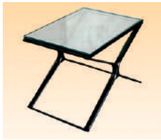
Teaphoy - Rs.750 ( Each )