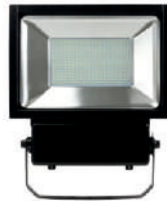
100w LED Light - Rs.1750