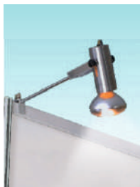
Spot Light - Rs.450