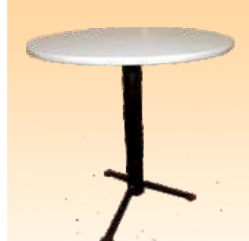
Wooden Top Round Table - Rs.1400