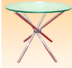
Glass Top Round Table - Rs.1500