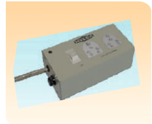
5amp Power Socket - Rs.500