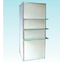
Glass shelves - Rs.600 ( Each )