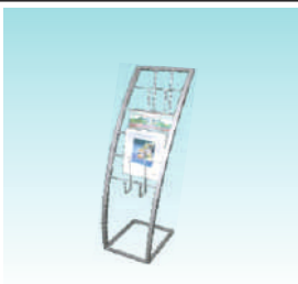
Magazine Rack - Rs.1200 ( Each )

Redefining Water Exhibitions in South Asia