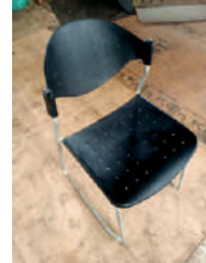
Standard Chair - Rs.450