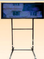
LED TV 50" - Rs.7000 ( 3 Days )