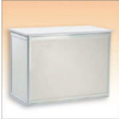
Octonorm Table - Rs.1100