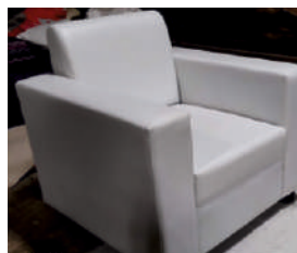
Single Seater Sofa - Rs.1500