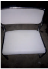
White Chair - Rs.550