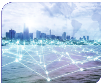
Emerging Trends & Innovations