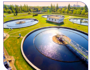
Wastewater Treatment & Reuse