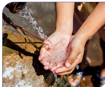
Water Conservation & Management