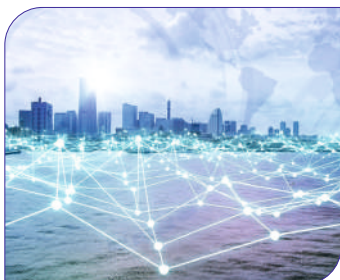
Emerging Trends & Innovations